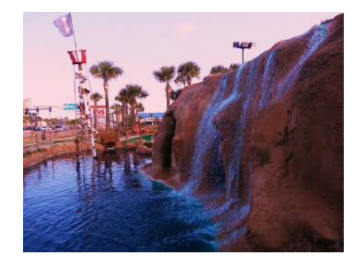
The Challenging Course

SPECIAL NOTE: We will begin our Fall Meetings on Tuesday, September 10<sup>th</sup> with Dinner at 6:00 PM and a discussion to follow on the groups' Fall format, participation in the Haunted House Mission Project and our annual Christmas Play. Mark your calendars and plan to attend!