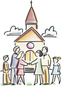
Invite a Friend to Church

Hello and welcome to the September edition of POUCC newsletter! After a successful meeting with the congregation, we are moving forward with the line of credit from UCC Cornerstone Fund pending no issues with the contract as stated in our meeting. Please know how glad I am that everyone was engaged and interested in the meeting. One point I want to make again is simply it is up to us as members and friends of the POUCC to make this work. New persons in our Sanctuary to enjoy our services will make us meet our goals and help fill persons' spiritual cups. Lord knows we need that today! As always, may God bless you and keep you well.