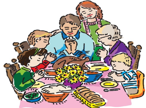
"Blessing and glory and wisdom and thanksgiving and honor and power and might be to our God forever and ever! Amen." Revelation 7:12, NRSV