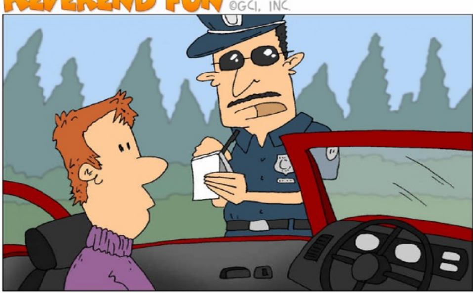
GOD GAVE YOU FREE WILL ... THE CITY DID NOT